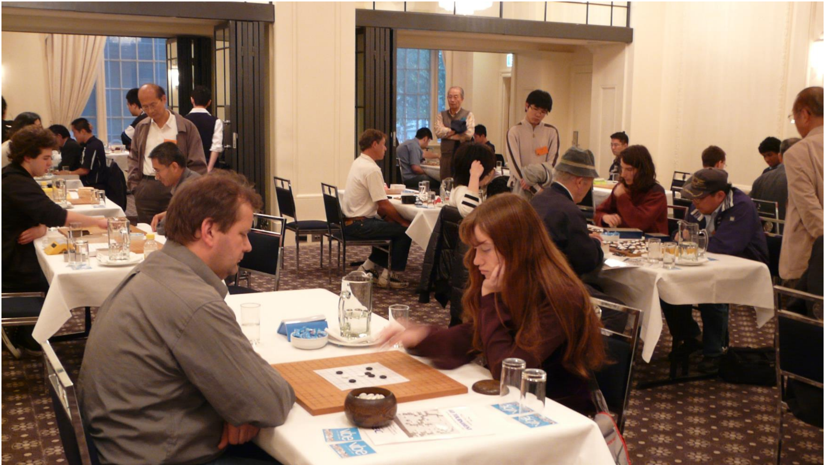
NEC Cup 2009