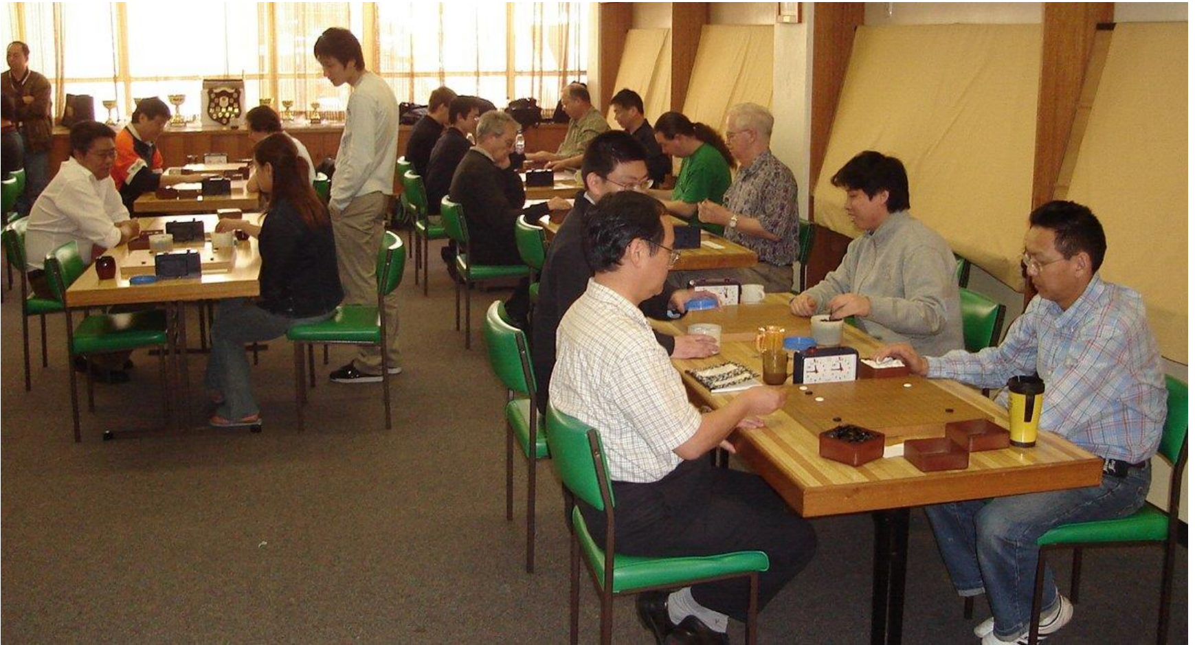
National Championship 2007 (Sydney Go Club)