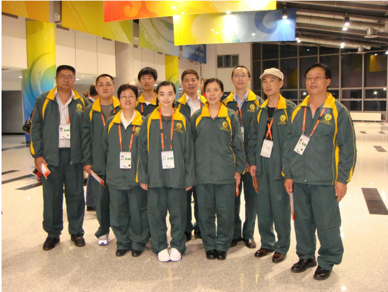
Team Australia WMSG Beijing 2008