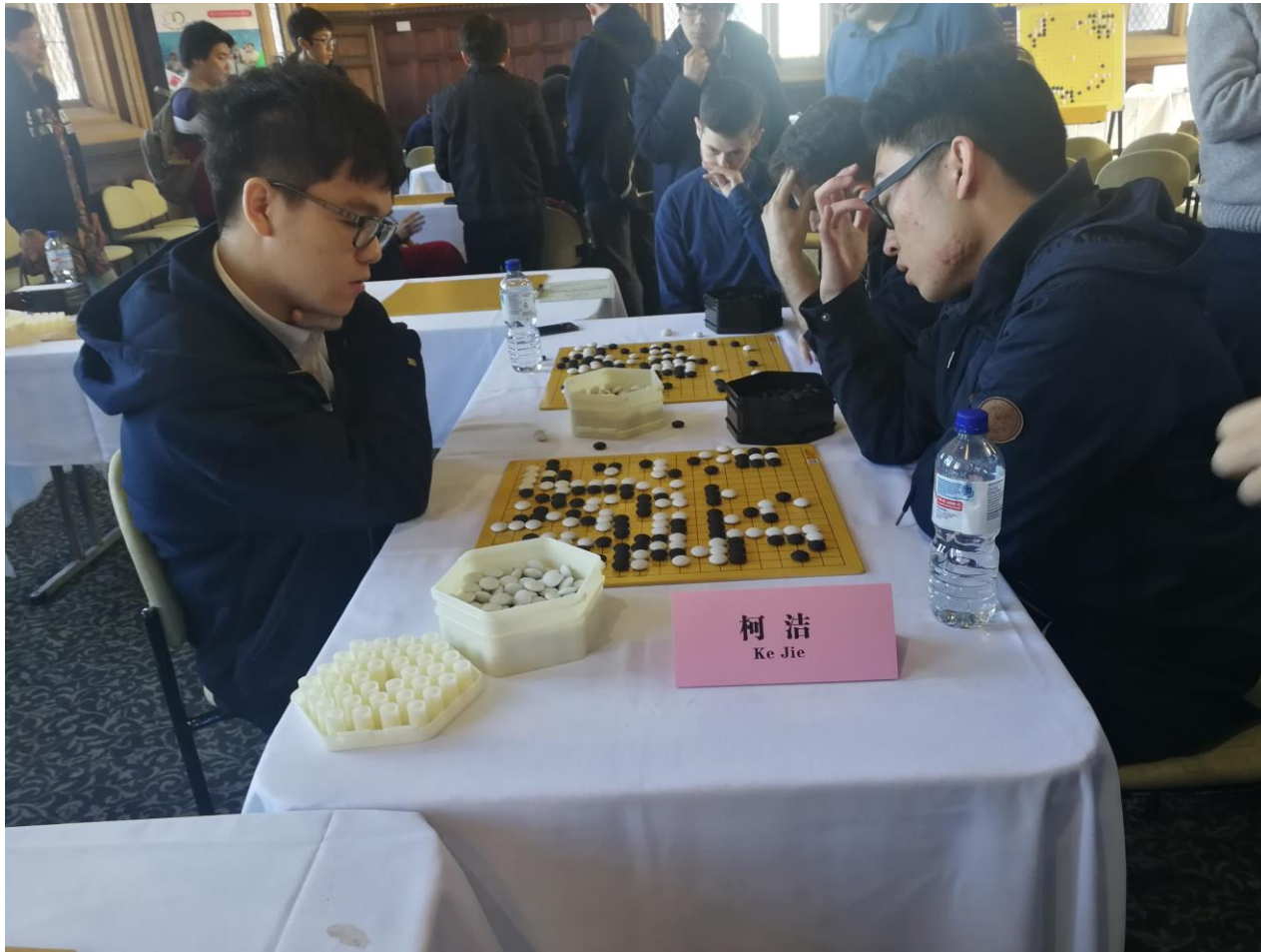
Ke Jie (World Collegiate Weiqi Championship, Sydney, 2019)